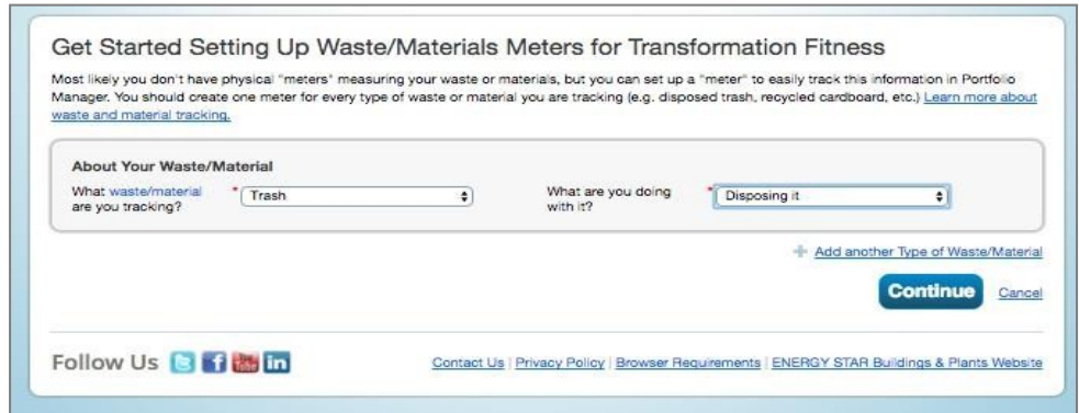
Figure 1: Setting up property meters

To receive the most accurate picture of your building's performance, tell Portfolio Manager how much energy and water your building consumes, and the volume of waste and materials that you generate. Follow these steps to enter energy, water, and waste data for your property.