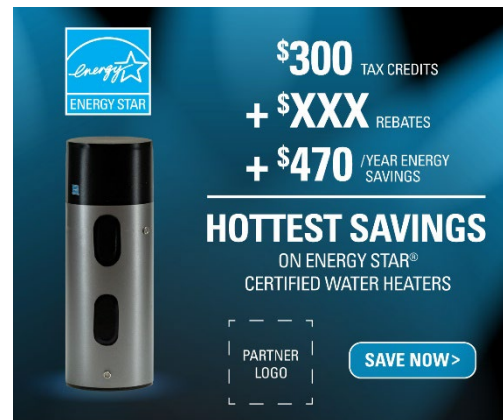
Sample social graphic and partner banner

We hope that you will seize this opportunity to engage your customers around the many benefits of heat pump water heaters that deliver big on energy, money and environmental savings by joining us for Heat Pump Water Day and the ENERGY STAR water heater promotion.