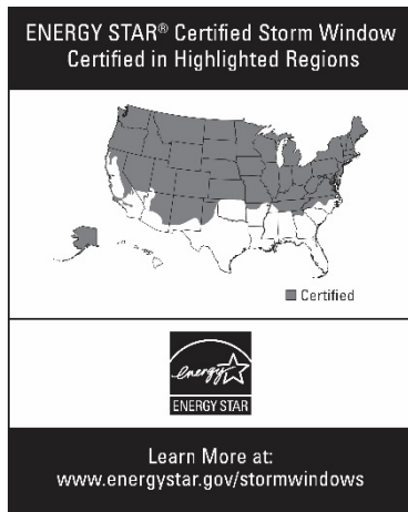
Label 1: North/North-Central Zone