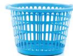
Water Usage Per Load