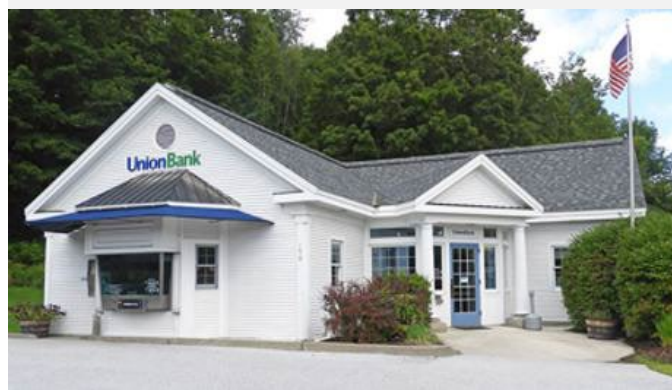
Union Bank Johnson Branch, Johnson, VT. First ENERGY STAR certified in 2020.

86 buildings earned the ENERGY STAR to-date, including 32 schools, 2 hotels, 4 hospitals, and 12 office buildings.