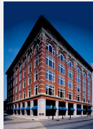
Miller's Building, Knoxville, TN. First ENERGY STAR certified in 2008.