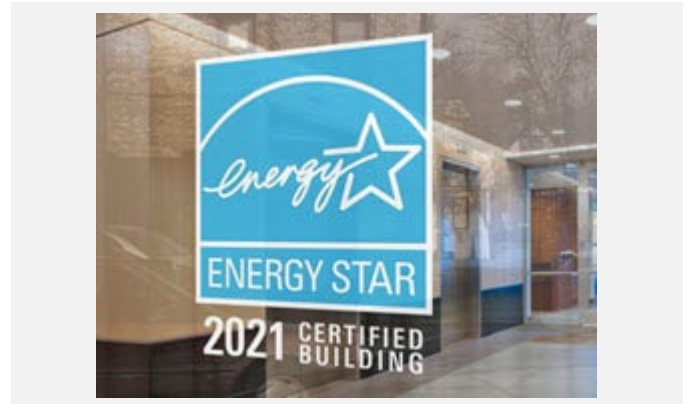
George McGovern Middle School, Sioux Falls, SD earned ENERGY STAR certification in 2021.

92 buildings earned the ENERGY STAR to-date, including 47 schools, 1 hospitals, 9 office buildings and 3 industrial plants.