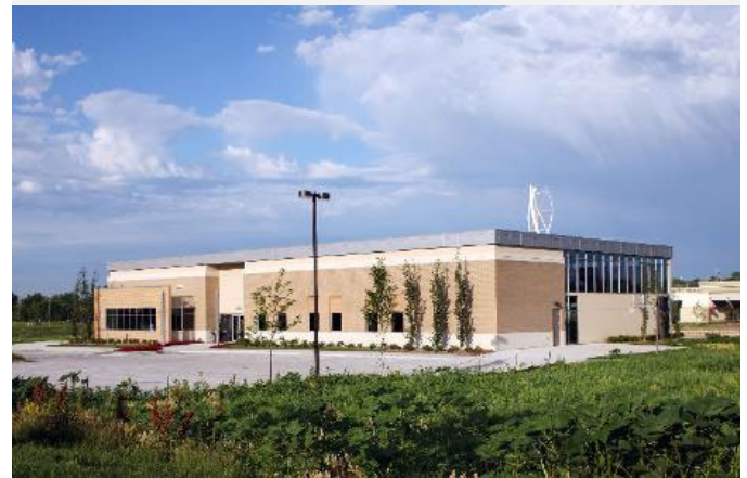
4940 Building, Omaha, NE. First ENERGY STAR certified in 2009.

159 buildings earned the ENERGY STAR to-date, including 40 schools, 1 hotels, 3 hospitals, 46 office buildings and 3 industrial plants.