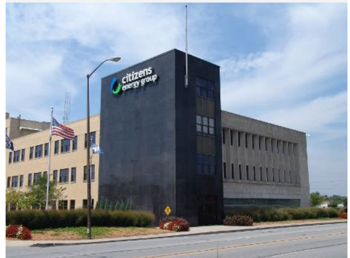
Citizens Energy Group, Indianapolis, IN. First awarded ENERGY STAR certification in 2012.

903 buildings earned the ENERGY STAR to-date, including 423 schools, 8 hotels, 7 hospitals, 122 office buildings and 13 industrial plants.