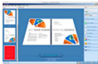
Xerox ® Integrated Fiery ® Color Server