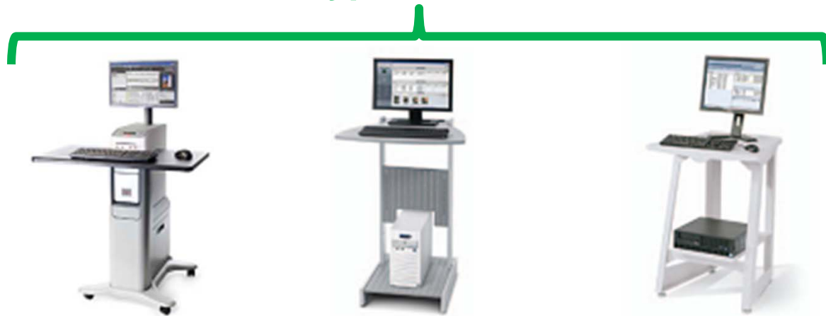
EX Print Server, Powered by Fiery ®