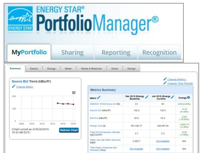
Figure 1: MyPortfolio landing page.

All property types can use Portfolio Manager to measure and track energy, water, and waste. The tool contains an expanded list of property types – 85 total – offering more specific categorization to facilitate comparison among properties.