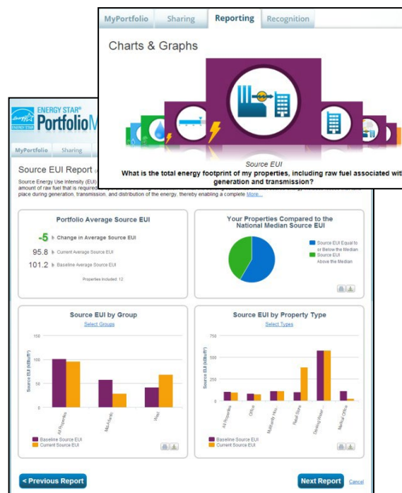
Figure 4: Visual display of design reports.