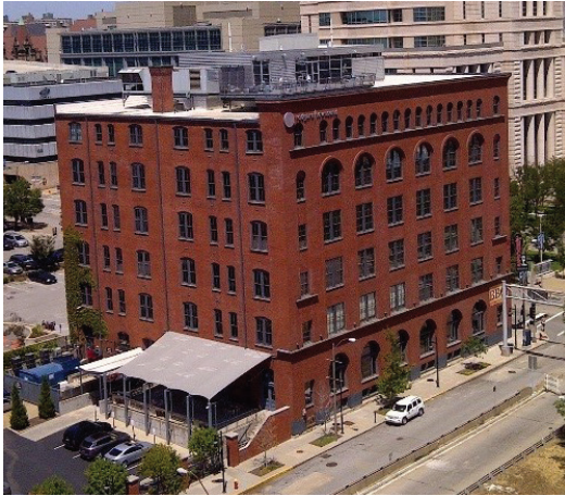
Pictured: Cupples Station 1