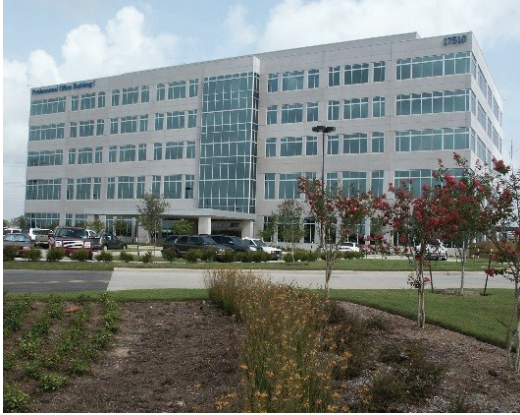
Pictured: Memorial Hermann Sugar Land Medical Plaza 1