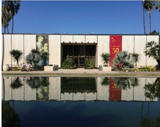
Pictured: Putnam Foundation, Timken Museum of Art