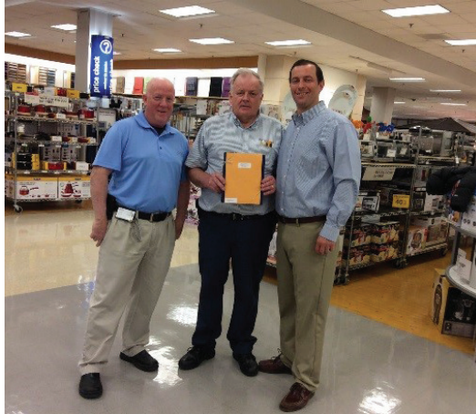
Pictured: Remotti's Ropers Energy Team