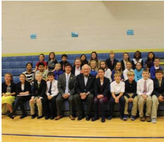
Pictured: Simmons Elementary Student Energy Team