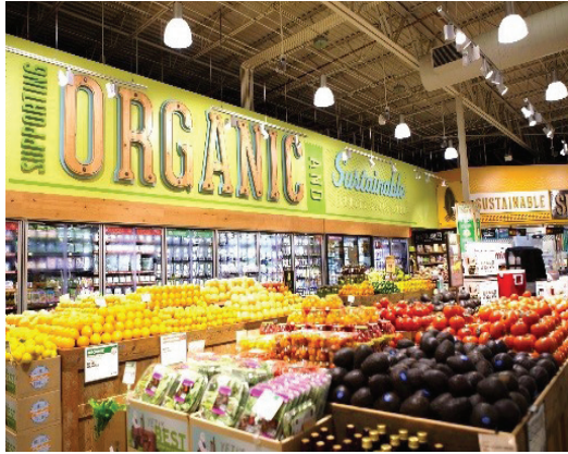
Pictured: Whole Foods Market Gateway