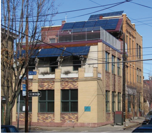
Pictured: CCI Center