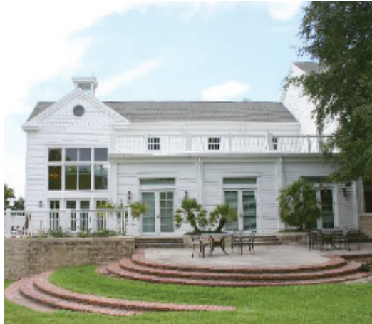
Pictured: The Garden House at Harry P. Leu Gardens