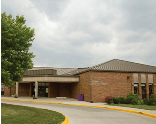
Pictured: Pleasant Hill Elementary School