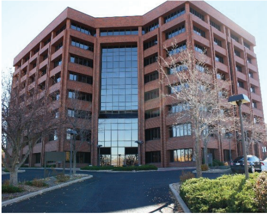
Pictured: Sixth Avenue West