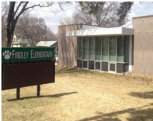
Pictured: Findley Elementary