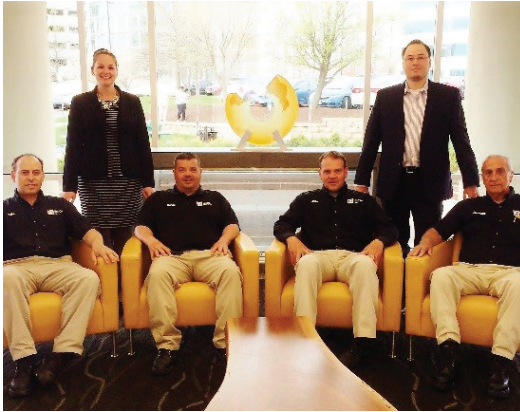
Pictured: The Energy Team at 13461 Sunrise Valley Drive