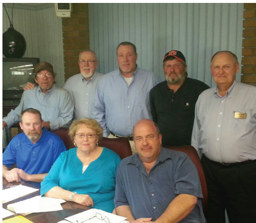
Pictured: Going Blue for Woodville's Energy Team