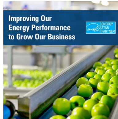
Fruit and Vegetable Processing