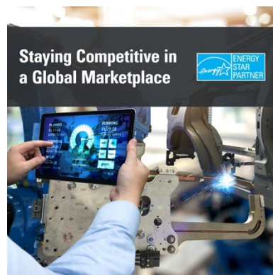
Motor Vehicle Manufacturing