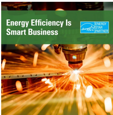
Aerospace and Defense