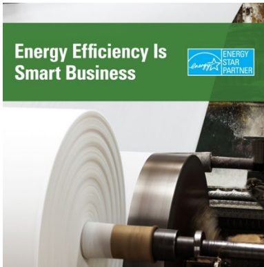
Pulp and Paper Manufacturing