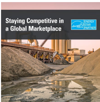
Asphalt Paving Manufacturing