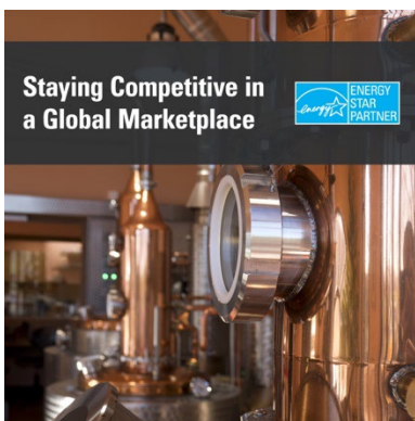
Distilled Spirits Manufacturing